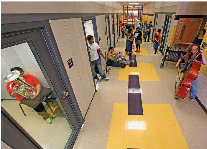
SOUND-ISOLATION PRACTICE ROOMS

Henry considered Wenger practice rooms to be “non-negotiable” for this new facility. “The architect wanted to bid the Wenger practice rooms against built-ins, but I wasn’t compromising,” explains Henry, who had visited other schools where the built-in practice rooms lacked adequate sound isolation.