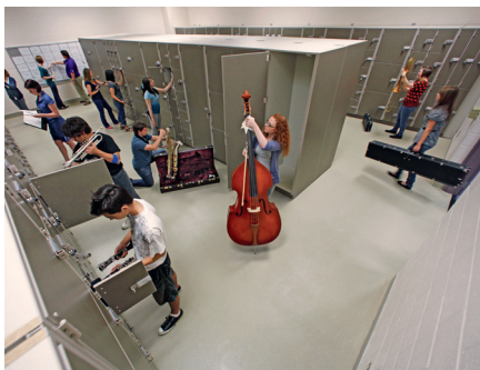
INSTRUMENT STORAGE CABINETS

CONDUCTOR'S SYSTEM, ROUGHNECK® MUSIC STANDS AND NOTA® CHAIRS